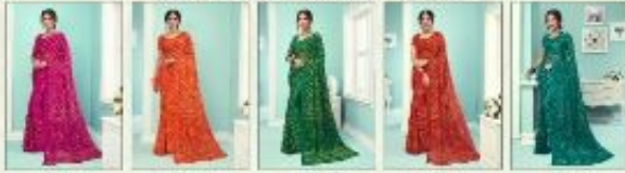
12801 A 12801 B 12801 C 12801 D 12802 A