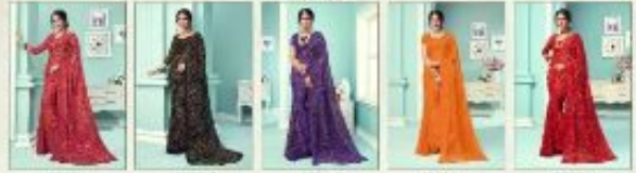
12802 B 12802 C 12802 D 12805 A 12803 B