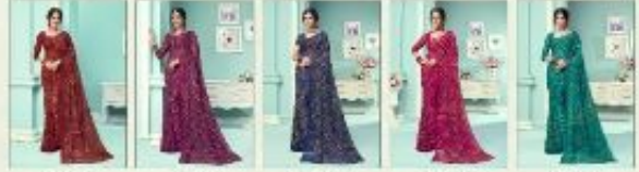
12804 D 12805 A 12805 B 12806 A 12806 B