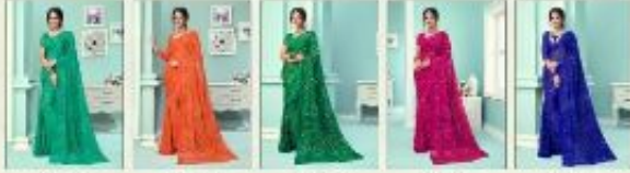
12803 C 12803 D 12804 A 12804 B 12804 C